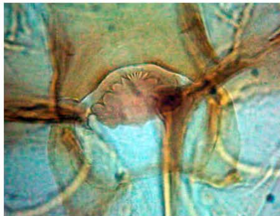
Fig. 3: Microphotography of buccal armature of Sergentomyia (Sergentomyia) dentata (Sinton, 1933), from Isfahan city. Cibarium of female (high magnification)